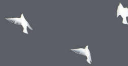
Figure 1. Outreach Versus Film Promotion