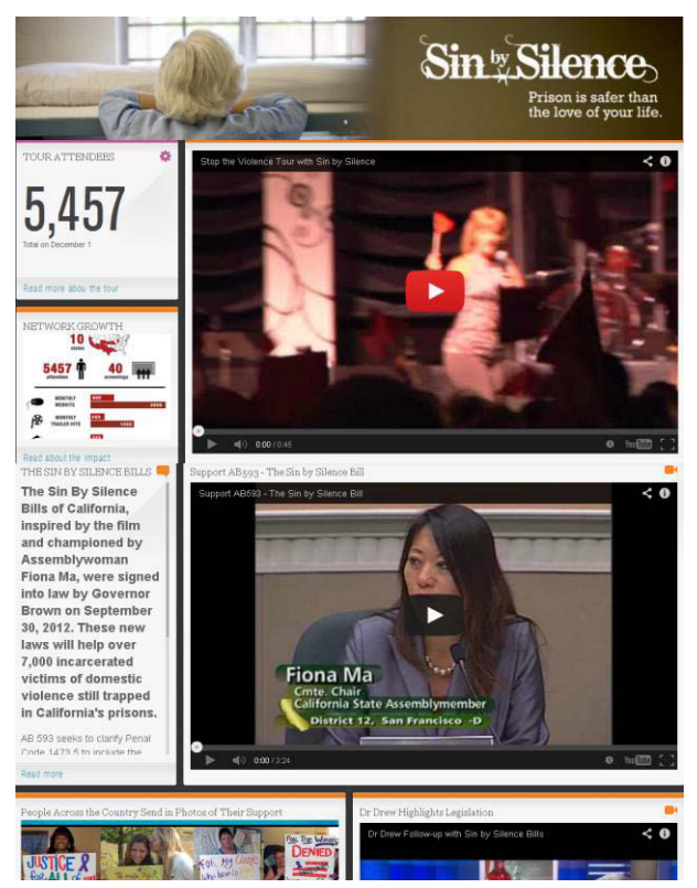
Select segments of Sparkwise dashboard for the film, Sin by Silence by Quiet Little Place Productions. To see full dashboard, click here.

communicate impact to stakeholders who may not be attuned to the language of social justice. The Sparkwise dashboard generated strong interest in data visualization strategies combined with images, video, and narrative to convey impact through both story and numbers. Air Traffic Control uses Sparkwise and, according to Erin Potts, has found that it has "changed how we're thinking about what we're grabbing." She likes the widget that enables real time data capture from Google Analytics so that metrics automatically update online. Participants were able to imagine how Sparkwise (free and open source but customizable via widgets specific to a funder's interests) could be used by other funders. Michelle Coffey appreciated the open source nature of the tool as an alternative for funders to consider, even if it pushes them beyond their comfort zone. The McConnell Foundation is exploring innovative data visualization approaches. Favianna Rodriguez and others urged that the creative expertise of artists is a ready asset to transform how impact is communicated.