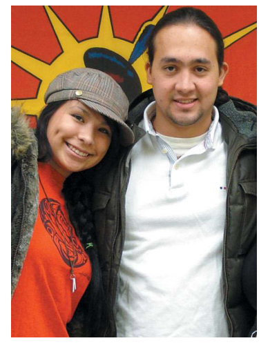
From YouthScape Initiative, J.W. McConnell Family Foundation

together in defining outcomes they both value.